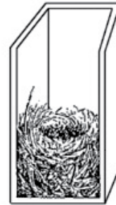
Eastern Bluebird nest