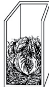
Tree Swallow nest